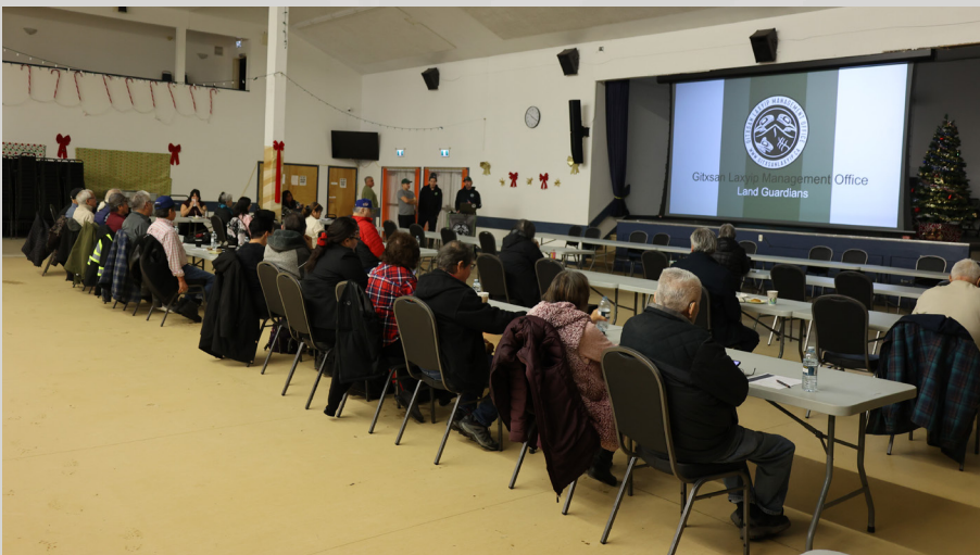
Land Guardians presentation on what they've been working on and what's coming up.