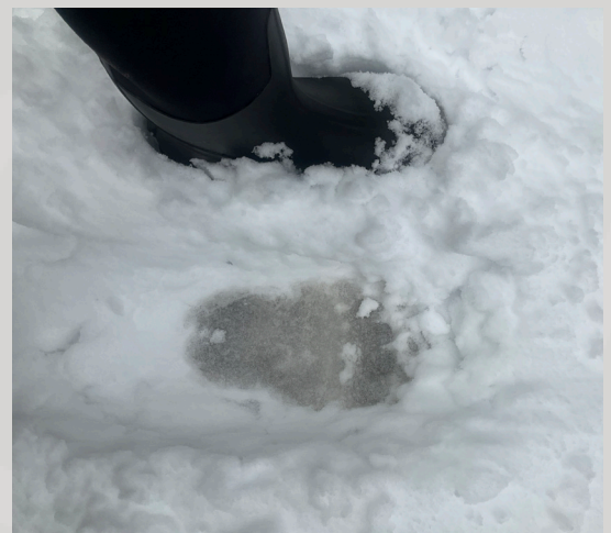
The Guardians come across a lot of wildlife on the Laxyip.