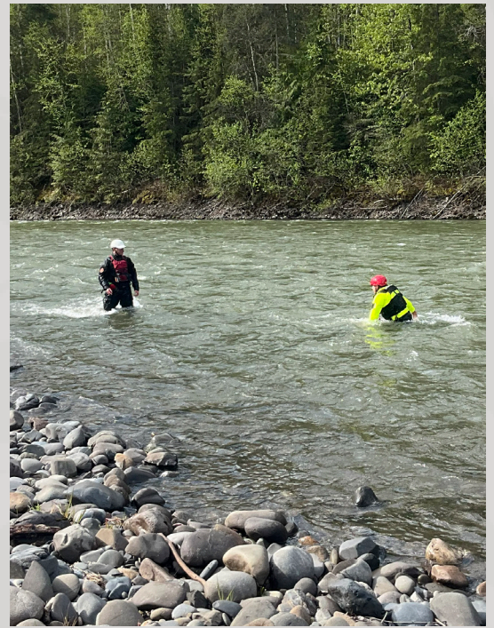
The Guardians taking Swift Water Training.

Using a new ArcGIS FieldMaps app on iPads, they recorded hunting activity, wildlife sightings, and kill sites. These findings are helping GLMO identify heavily used areas that may limit Gitxsan harvest opportunities and will inform future hunting regulation discussions, education efforts, and management decisions. Ongoing training remains a key part of the Guardians' work, ensuring they are prepared to respond when community members need assistance and to protect both people and the land. The Land Guardians will continue to be a strong presence on the Lax'yip.